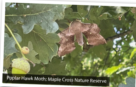
Poplar Hawk Moth; Maple Cross Nature Reserve

See who we've spotted around the Colne Valley Park recently.