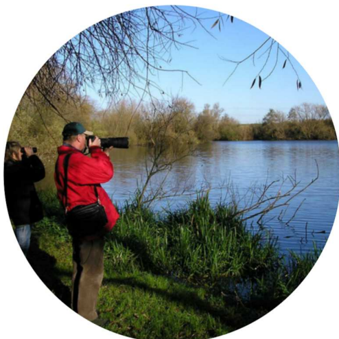
Preserve peaceful lakes from Rickmansworth to Wraysbury.