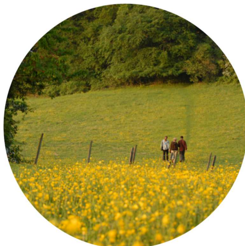
Improve and maintain well used circular walks from Gerrards Cross, Harefield, Langley, Chalfont St Peter and Staines.