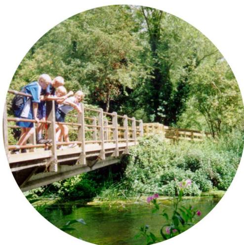
Help manage a stretch of the River Colne near Uxbridge, Cowley or West Drayton for wildlife and people