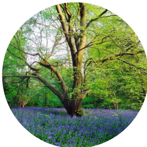
Make sure bluebell displays in Northmoor Hill Wood Nature Reserve, Denham improve each spring.