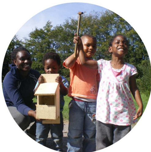
Connect local residents with green spaces in the heart of their communities in Colnbrook and Iver.