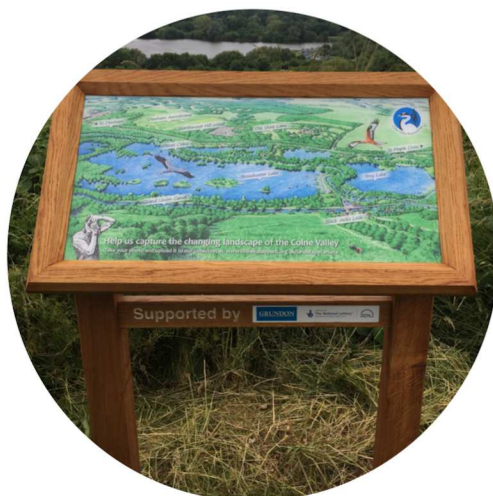
Have your logo on signs custom made to complement the landscape.