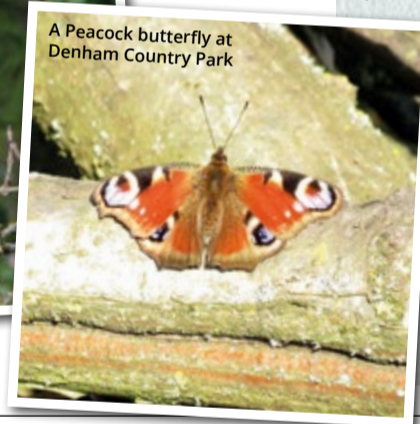
A Peacock butterfly at Denham Country Park