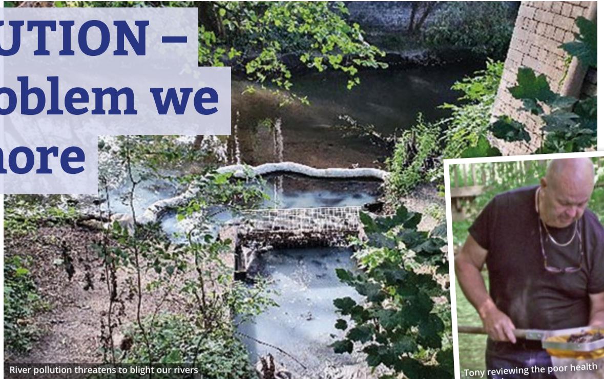
River pollution threatens to blight our rivers

Another big concern is the increasing problem of polluting outfalls discharging straight into our rivers. Most should only be carrying surface water run-off, but all too often misconnections