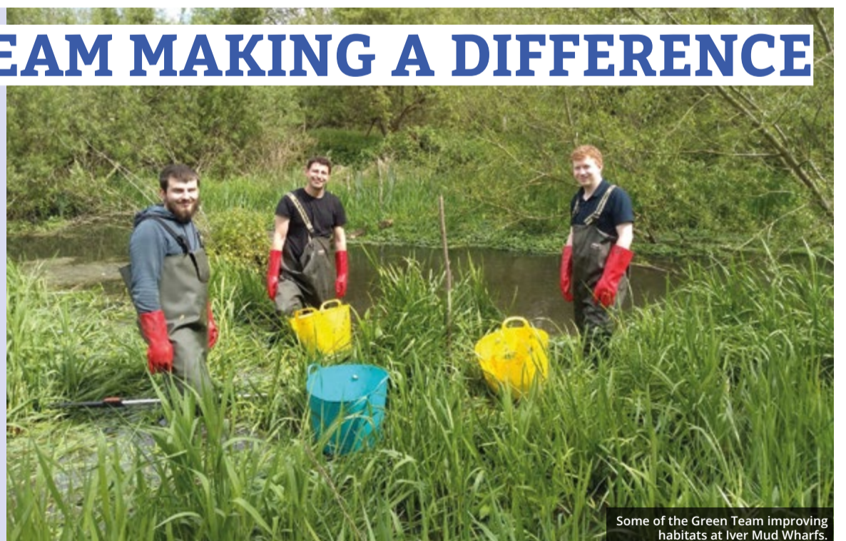
Some of the Green Team improving habitats at Iver Mud Wharfs.