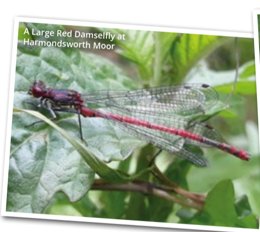
A Large Red Damselfly at Harmondsworth Moor

Here are a few of the recent sightings around the Park.