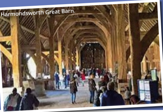
Harmondsworth Great Barn.