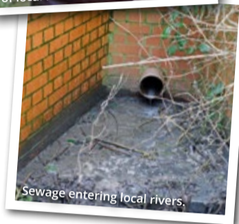
Sewage entering local rivers.