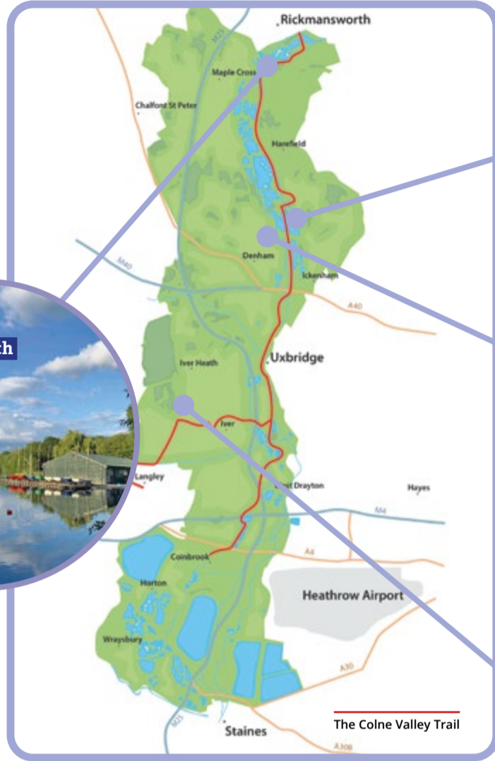
Grand Union Canal