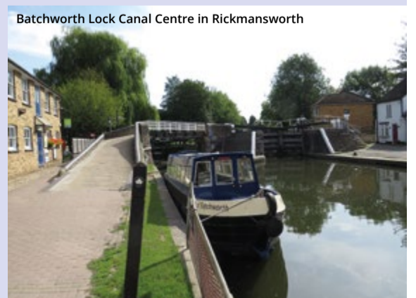
Batchworth Lock Canal Centre in Rickmansworth