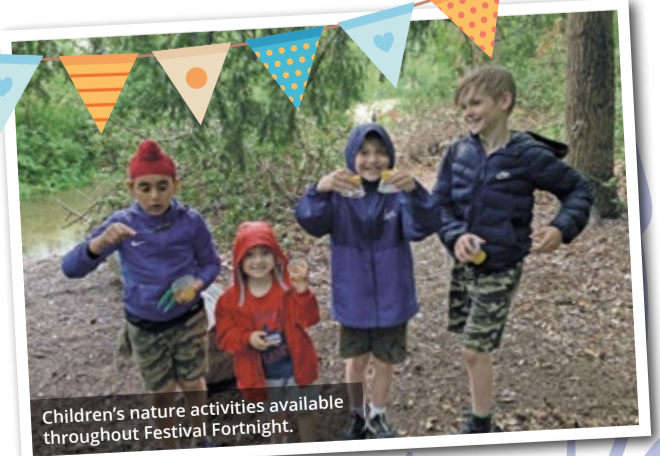
Children's nature activities available throughout Festival Fortnight.

As well as planning the Festival Fortnight, we have also been improving the signs for local rivers, The Colne Valley Trail (see Page 2) and Langley Park trails – we do hope you have spotted them on your travels. Connecting with your local countryside has an array of benefits for your whole family, and through our website and social media posts we help you to explore the Park. Don't forget to go to our ' visit ' and ' activities and events ' website page to stay up to date with everything on offer and for details of our Festival Fortnight – and for details of our