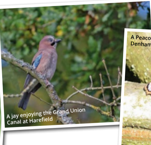
A jay enjoying the Grand Union Canal at Harefield