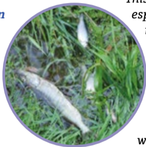
Dead fish following a pollution incident.

improvement and conservation projects. Affinity Water Ltd is also an active partner. Initiatives include the monitoring of polluting outfalls, aiding research into harmful river pollutants and more. These projects are lifelines to our wildlife and environment. Dedicating so much time does mean sacrifices, and that is why I am constantly looking for people who can share the workload."