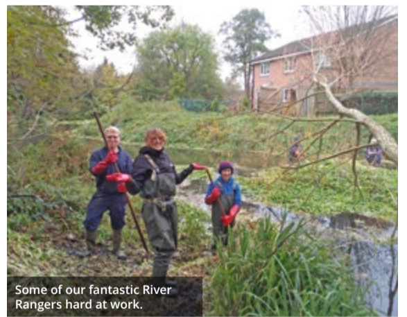
Some of our fantastic River Rangers hard at work.

Have a look on our website and follow us on social media, where you will find lots of useful information on places to go, things to do, volunteering opportunities and updates about the Park and your local countryside.