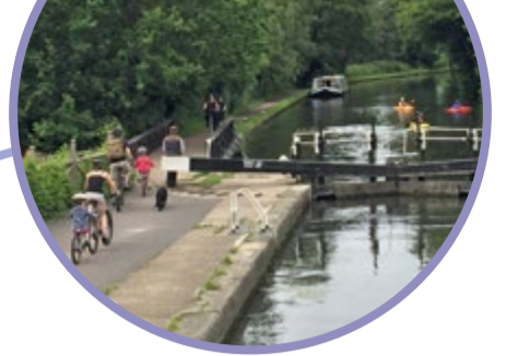
Denham Country Park