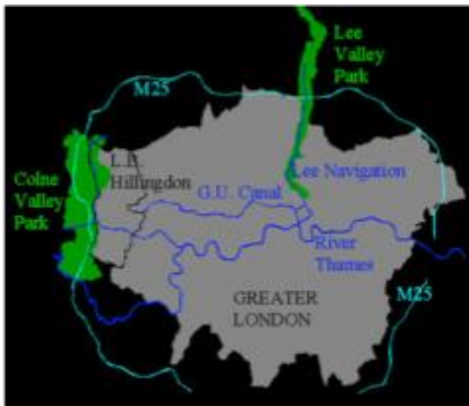
Images showing general location of the Colne Valley Regional Park (above) and the northern part of it (on the right)