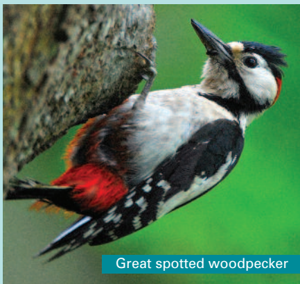
Great spotted woodpecker