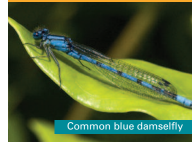
Common blue damselfly

Look near the pond for southern hawker and ruddy darter dragonflies, azure and common blue damselflies.