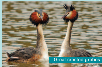
Great crested grebes