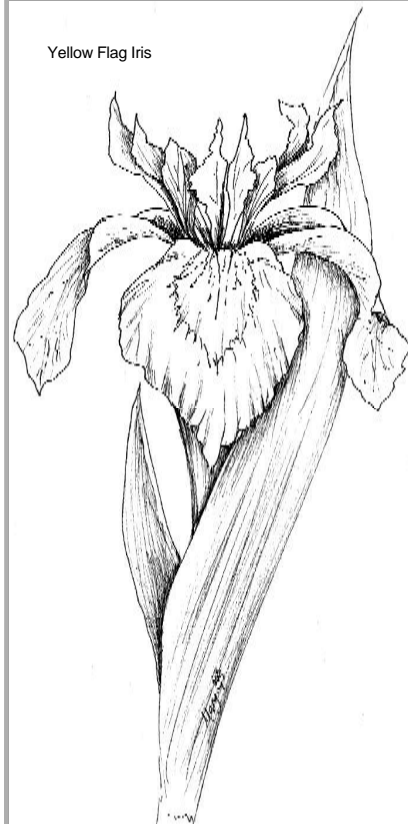
Yellow Flag Iris

The canal is now a haven for wildlife. You will see Dragonflies flying over the surface and many plants at the waters edge such as Yellow Flag Iris.